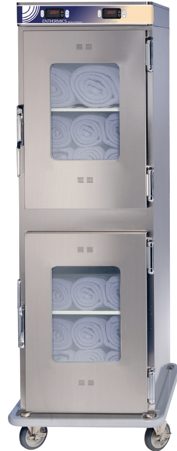
Shown with optional bumper