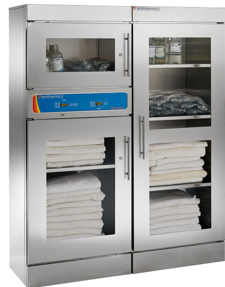
Storage cabinet shown with right hinge. EC1350BL shown with optional left hinge

Pair your storage cabinet with a warming cabinet. By choosing a left-hinged warming cabinet and a right-hinged storage cabinet, you can create a French-door design and easily transfer supplies from one unit to the next.