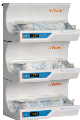
ivNow-3 warms 75 liters in a 12 hour period.